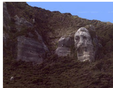
The adjusted version.

It is not perfect but is an example of what you can do post processing. The images have been resized to fit into the newsletter and the adjustments were done with Paint and Faststone Image Viewer.