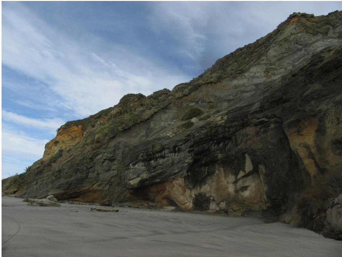
Landscape en-route to Farewell Spit

Any personal items are brought to the Learning Centre at your own risk. SeniorNet Papakura and its members cannot be held responsible for any loss or damage. We urge all members contemplating removing such items from their home to carefully check their Insurance Policy or with their Insurance Company to ensure the item is fully covered.